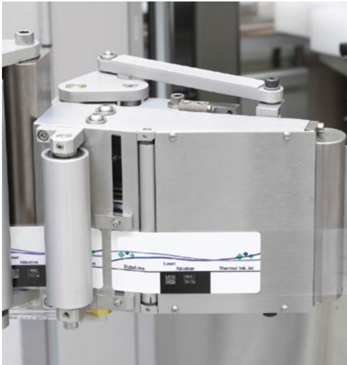
DETAIL OF INTERCEPTOR