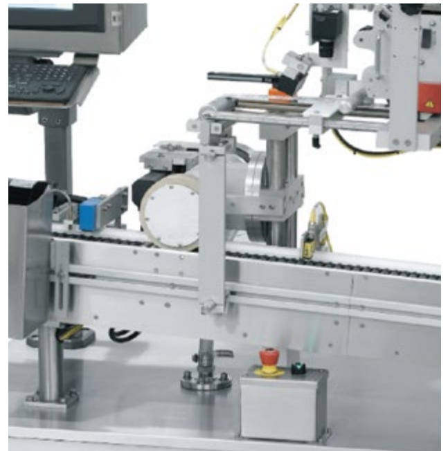
HR HORIZONTAL ROLLER IN-LINE LABELER

WLS Sales and Service assures responsive and comprehensive technical assistance in solving your labeling application problems, servicing your WLS equipment, and providing a full line of compatible systems supplies.